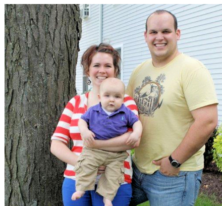
A treasured family photo of us at the Sonic Drive-In Rose Hill, KS—2002 Picture was later signed by President George Bush!