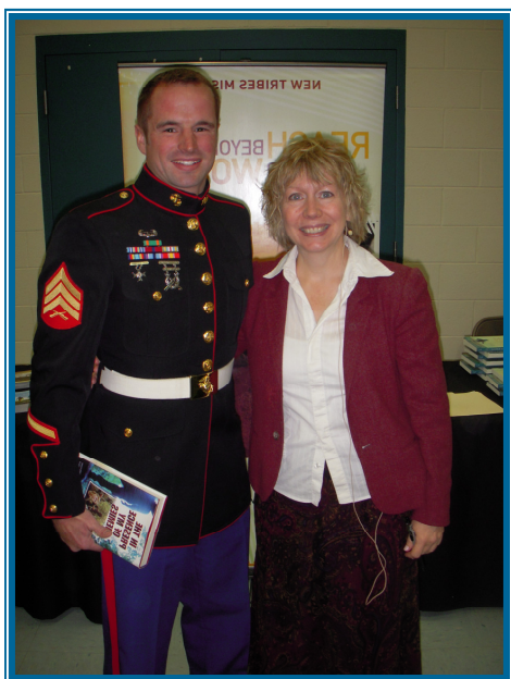
What an honor to meet someone who was a part of our Rescue Team!

crowd that evening when I introduced him and told everyone that "he was there when I was rescued." Very special.