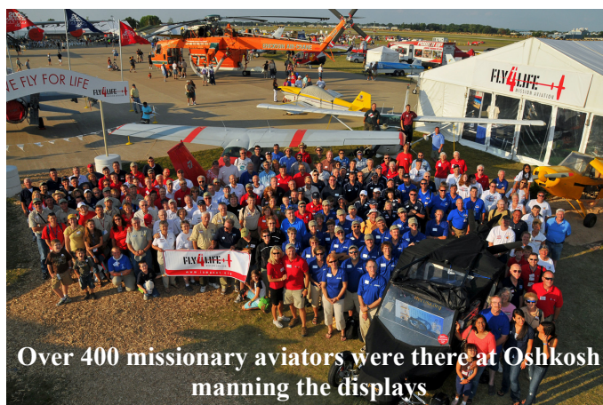
Over 400 missionary aviators were there at Oshkosh manning the displays