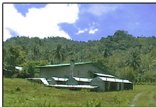
Herbal Processing Plant Capacity to dry 1000 kilos of herbs per week

I remember when Martin & I were traipsing through the jungle we talked about ways that someone could develop businesses in the poverty stricken areas of the island we were on...perhaps a fish cannery or factory...to enable those Muslims to support their families without having to resort to joining the Abu Sayyaf as a means of realizing their dreams.