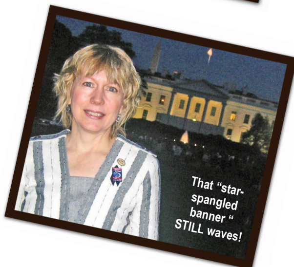
That "star-spangled banner" "STILL waves!"